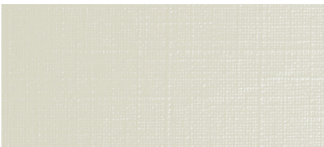
Linen Texture multiple color options