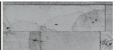
Patterns endless color options