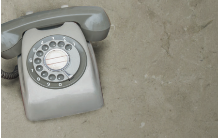
THE CLASSICS COLLECTION

Look at our patterns available in our collections