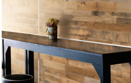
THE FOREST COLLECTION