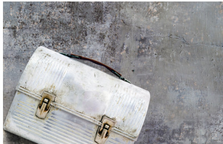
THE CITY WORKS COLLECTION