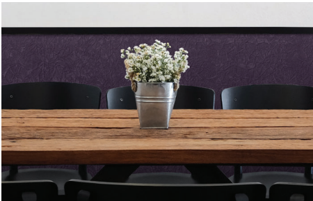
THE RUNWAY COLLECTION