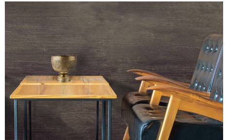
THE PATHWAYS COLLECTION