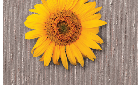
THE HEARTLAND COLLECTION