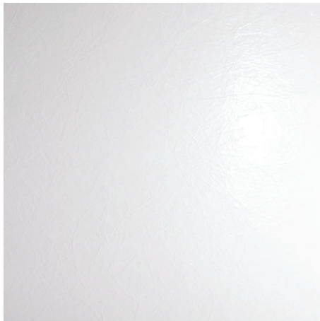
POLAR WHITE (8016)