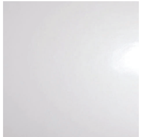
POLAR WHITE (8410)