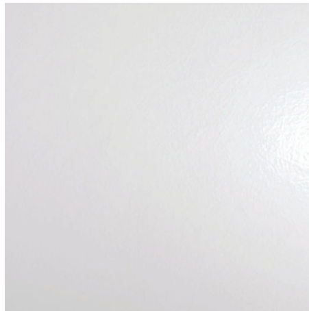
POLAR WHITE (8211)