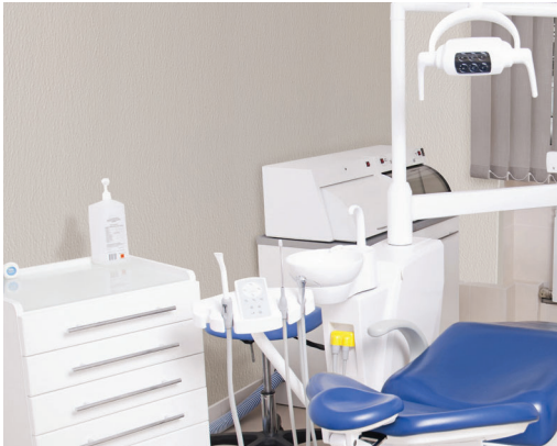
ALMOND BREEZE SANDSTONE (866)