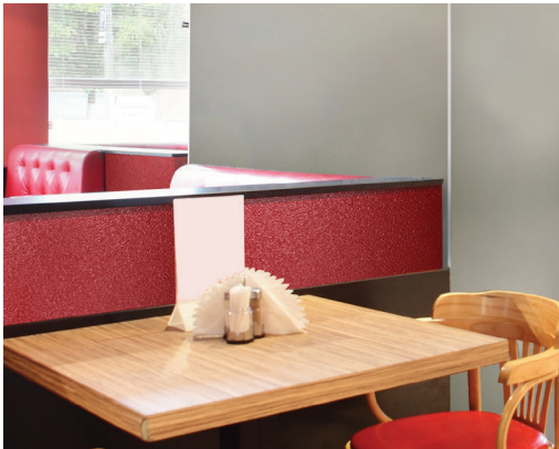
MAUNA RED SANDSTONE (1296) + MORNING MIST GRAY SANDSTONE (636)