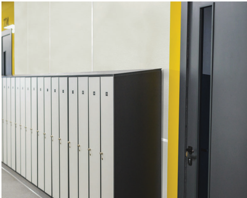
SUGARLOAF SAND (1294)

Take your surfaces beyond the traditional frp white bumpy board. Our Varietex resilient wall coverings offer you a wide range of stylish finishes and colors, while still meeting the sanitary requirements of even the toughest commercial environments.